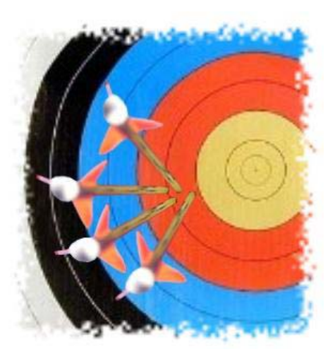
Fig. 4. High precision with poor accuracy

ArcAd online short circuit calculator carefully handles input data tolerances and tracks error propagation through massive computations associated with short circuit analyzes. Listed are some rules for approximate calculations adopted by the calculator: